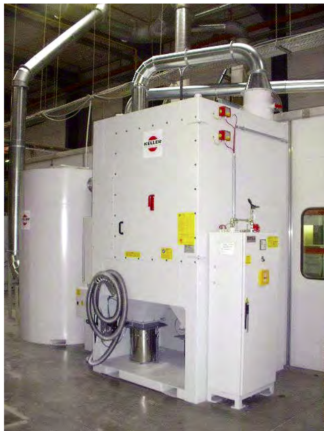
Laser processing of Example of a designed system, L-Cut 4 DOS with activated carbon filter and automatic CO 2 extinguishing system