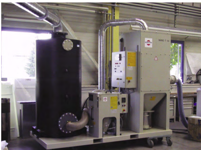
Example of a designed system, VARIO with activated carbon filter

The disadvantage of laser cutting organic substances has been the creation of aerosols that can only be captured and separated by the installation of costly mechanical systems. The resultant contaminants can clog dry working filters in a short period of time. Cleaning has been accomplished by washing, the use of catalytic converters or with thermal combustion, but an innovative dry working exhaust system would be a preferable economical alternative.