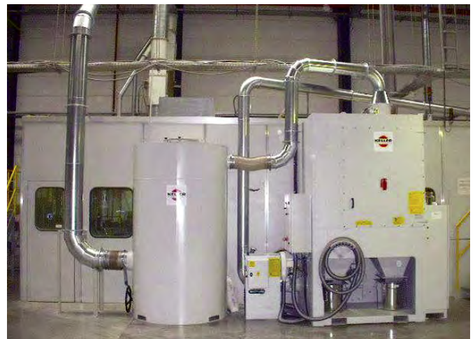
Example of a designed system, L-Cut 4 DOS with activated carbon filter automatic CO 2 extinguishing system