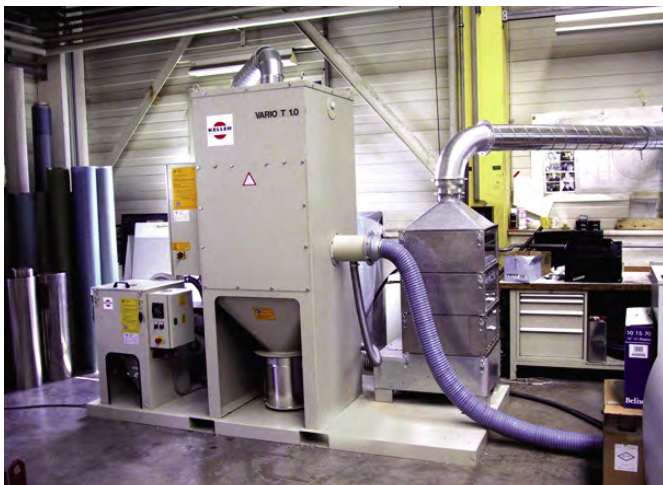
Example of a designed system, VARIO with activated carbon filter

System to separate organic substances that are created during laser processing.