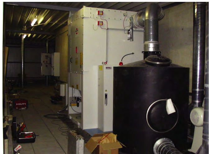
Example of a designed system, L-Cut 4 DOS with activated carbon filter automatic CO 2 extinguishing system